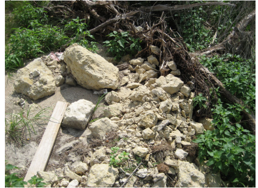
Spoils left over from diggings.