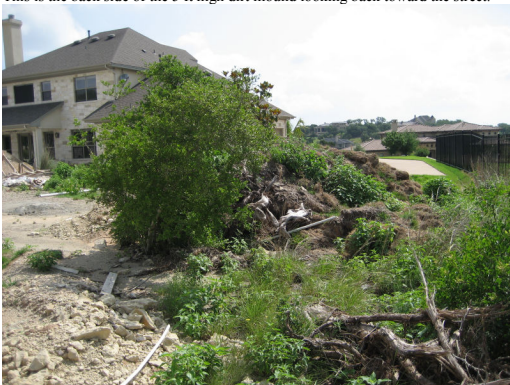
And from the dirt mound, this is what it looks like looking at our house.