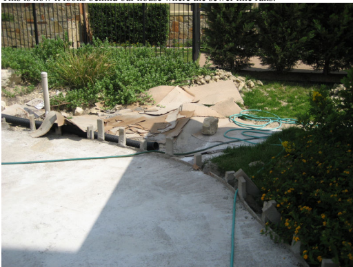
The sewer line runs past this set of steps.