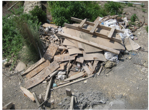
We used to have drainage here. Now its blocked by a mound of dirt.