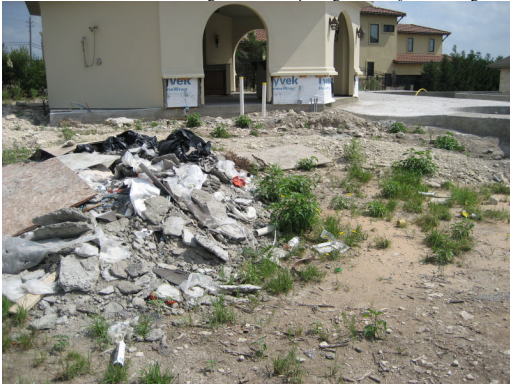
Here is outside the cabana looking back in the opening we were just standing in.