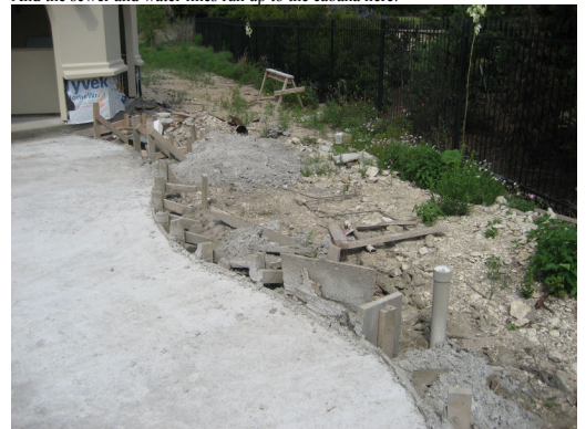
Looking toward the pool from the same spot....