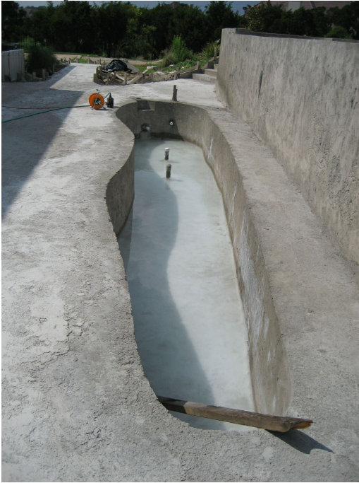
Here is looking from the other end of the lower recirculation pool.