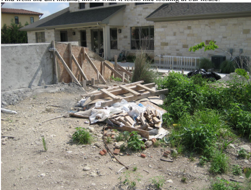
And from the dirt mound, this is what it looks like looking at our house.