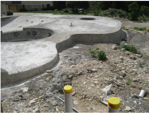
Here is outside the cabana looking back in the opening we were just standing in.