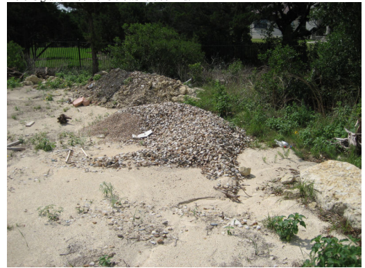
Spoils left over from diggings.